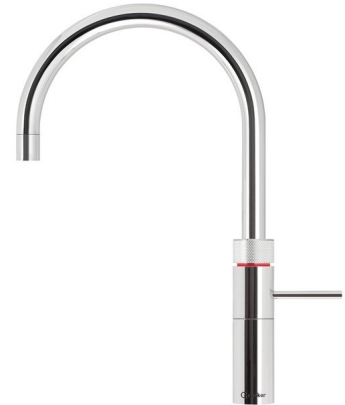
Fusion Round / Chrome