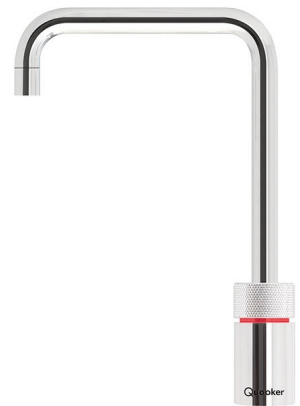
Nordic Square / Chrome Single Tap