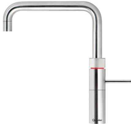
Fusion Square / Brushed Chrome

two stage safety tap for boiling water / insulated stem / dual mixer and boiling tap functions