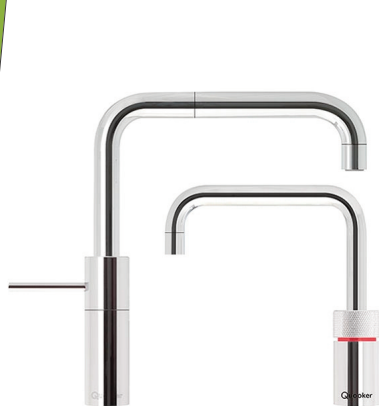
Nordic Square / Chrome

matching mixer and hot tap range / two stage safety tap / insulated stem / 360 degree use