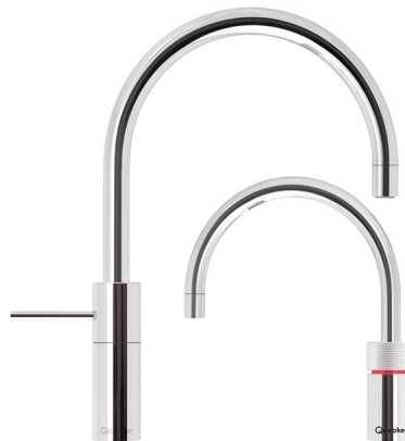
Nordic Round / Brushed Chrome